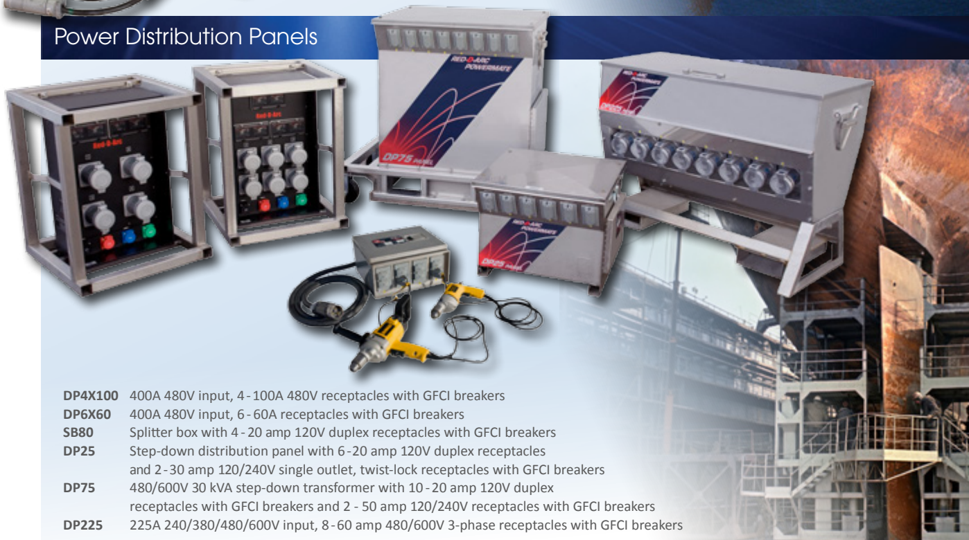
Power Distribution Panels

We rent diesel-powered electric generators that can supply up to 350 kW (440 kVA) of temporary power for welding equipment, electric-power-distribution panels and other shipyard electric-power requirements.