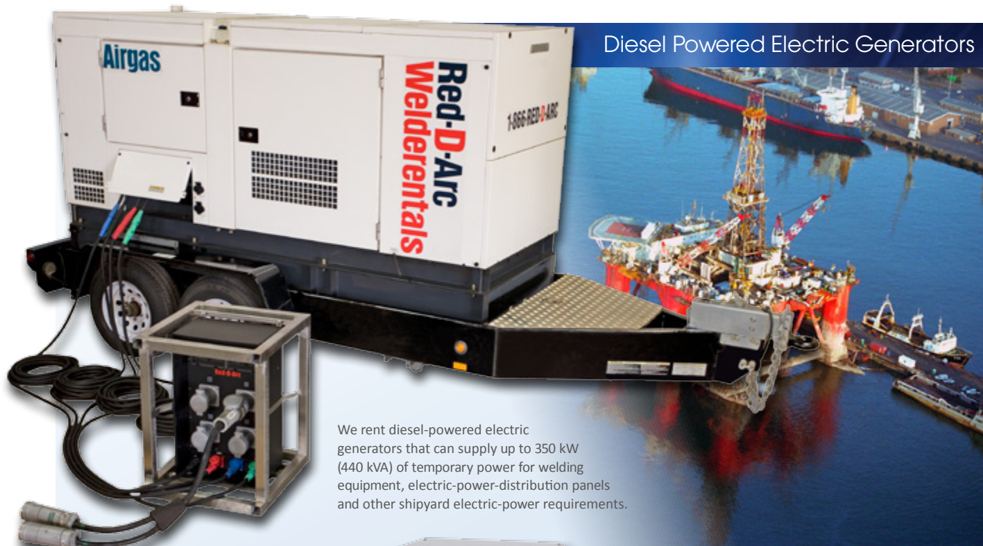
Diesel Powered Electric Generators

Welding and Power Solutions for Shipyards