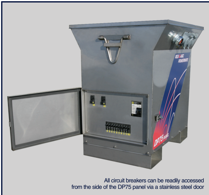
All circuit breakers can be readily accessed from the side of the DP75 panel via a stainless steel door