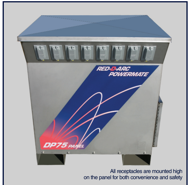
All receptacles are mounted high on the panel for both convenience and safety